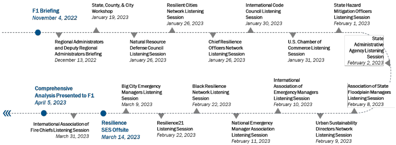
Figure 1. Timeline of Recent Road to Resilience Listening Events