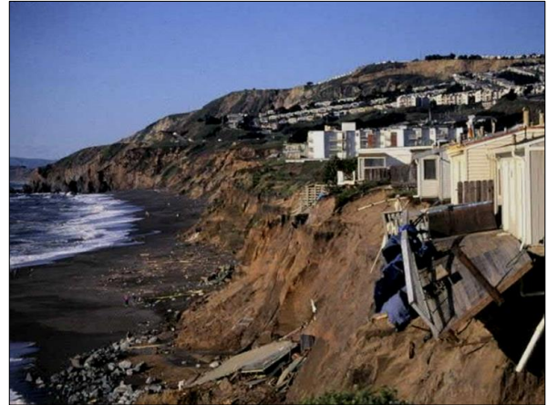
Coastal flood erosion at Pacifica, California.

The Federal Emergency Management Agency is the other primary federal agency focused on national flood issues. FEMA produces maps showing flood hazards for about 1 million of the 3.2 million stream miles in the nation 13 and nearly all coastlines 14 , so people can purchase flood insurance. More than 5.2 million flood insurance policies are currently in effect with over $1.2 trillion in insurance coverage 15 . However, flood losses in the U.S. reached an annual average of $10 billion in the 2000s, a nearly five-fold increase from the early 1900s 16 . In 2016 alone, the