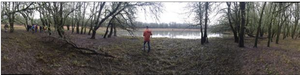
Wetlands on Sauvie Island, Oregon.

Again, from the president's book, "Sometimes your best investments are the ones you don't make." 25 I