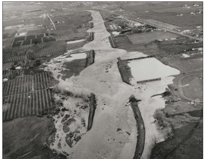
1965 Flood on the Walla Walla River in Oregon.

USACE manages the federal dams and levees in the U.S., part of the nation’s water resources civil works infrastructure. In addition to annual appropriations to maintain these dams and levees, in recent years USACE has frequently requested supplemental appropriations from Congress to cover unanticipated costs incurred for flood-fighting activities and repairs to flood-control infrastructure. For example, from 1987 to 2014 Congress gave USACE $32.2 billion in supplemental funding to augment its $61.3 billion budget for the same period 8 . In other words, natural disasters—mainly flooding from hurricanes—have caused USACE to go 53 percent over their appropriated budgets during that 27-year period.