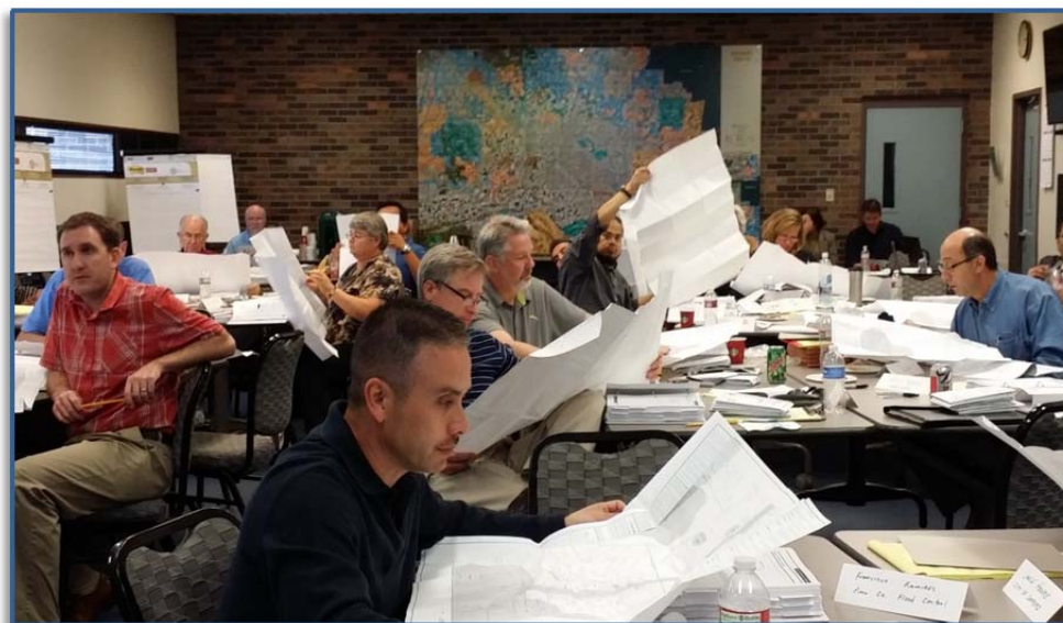
FEMA E- 273 Course Participants March 2014