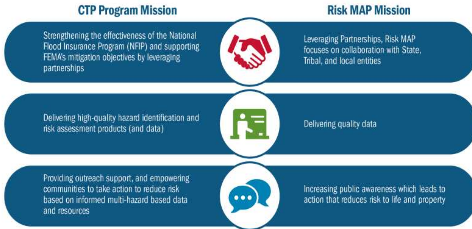
Figure 4: CTP Program and Risk MAP Missions