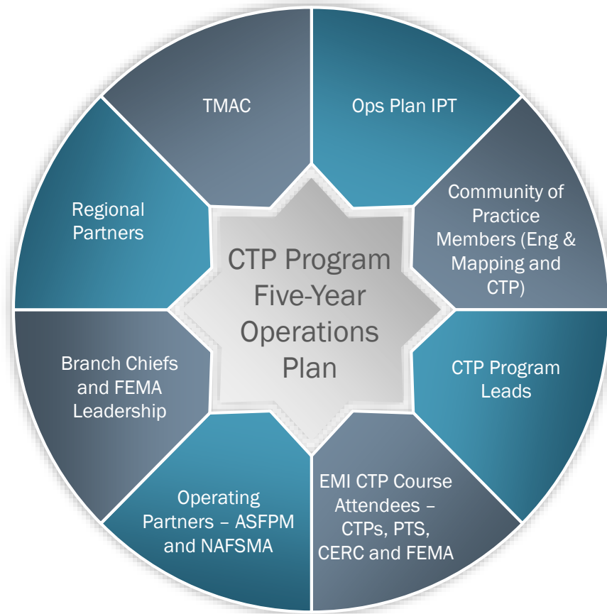
Figure 1: Key Stakeholders who informed the Ops Plan