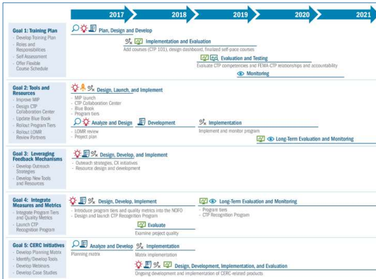
Figure 5: Implementation Plan