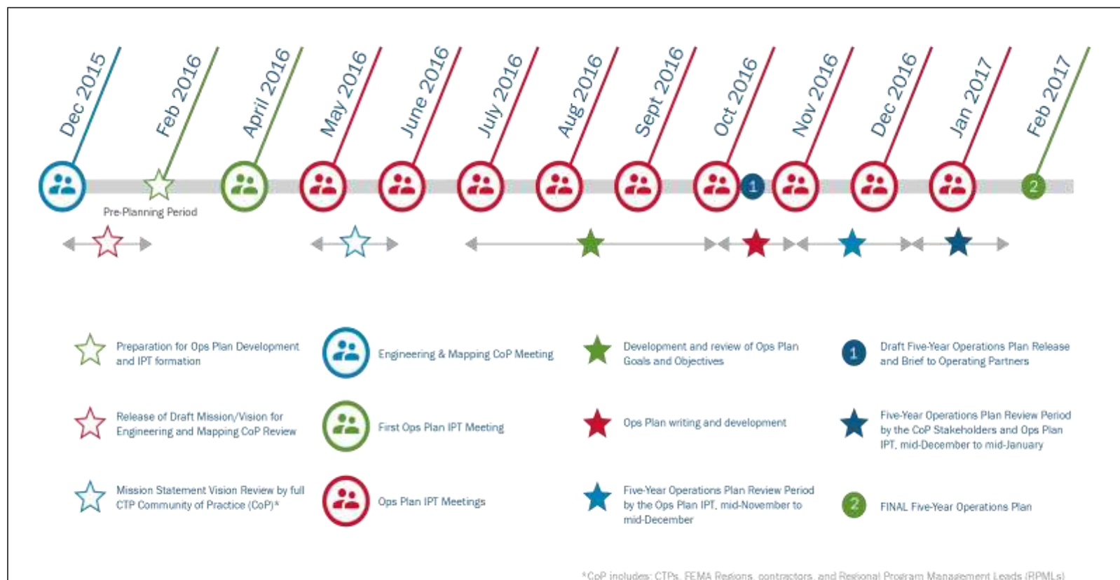
Figure 3: Stakeholder outreach and meetings

The CTP Program leveraged a number of stakeholders to evaluate and confirm the five Ops Plan goals.