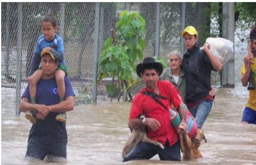
Romero Flooding

From Oct. 13-21, 2011, Tropical Depression 12-E hit El Salvador, causing the worst flooding disaster in recorded history. What started as a standard tropical depression and heavy rain event – characteristic of the country's wet season – soon became a full-fledged crisis. Heavy rainfall totaling 1.5 meters quickly eclipsed precipitation levels by nearly twice what had been observed over the same time period during Hurricane Mitch in 1998. With coastal soils waterlogged and unable to absorb such a massive amount of moisture, rivers in the region experienced peak flows never before seen by local communities or emergency responders.