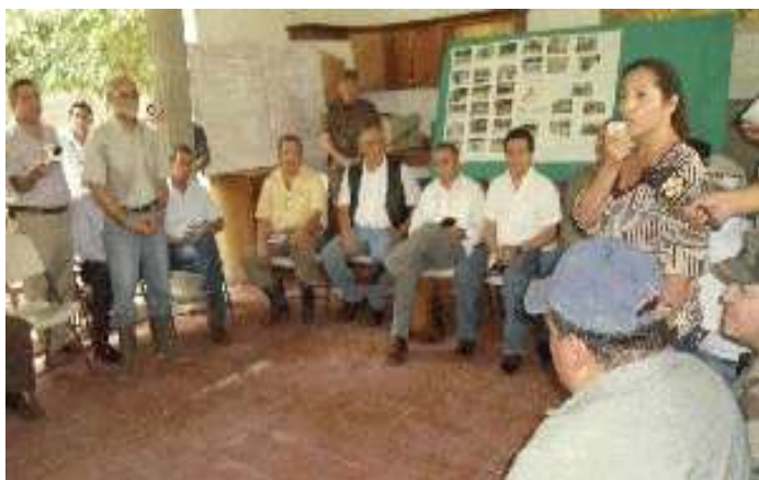
President Mauricio Funes sits in on emergency response discussions